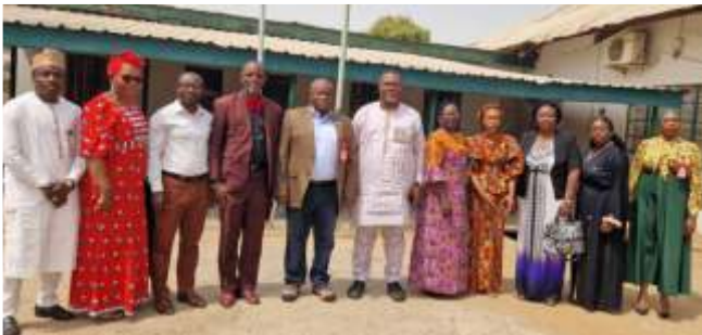
ADVOCACY TO NDLEA ZONAL COMMANDER