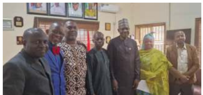
ADVOCACY TO NDLEA ZONAL COMMANDER