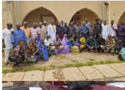
19.ACPN REPRESENTED AT A WORKSHOP BY NDLEA ON BANNING OF DRUG HAWKERS 25TH JULY 23