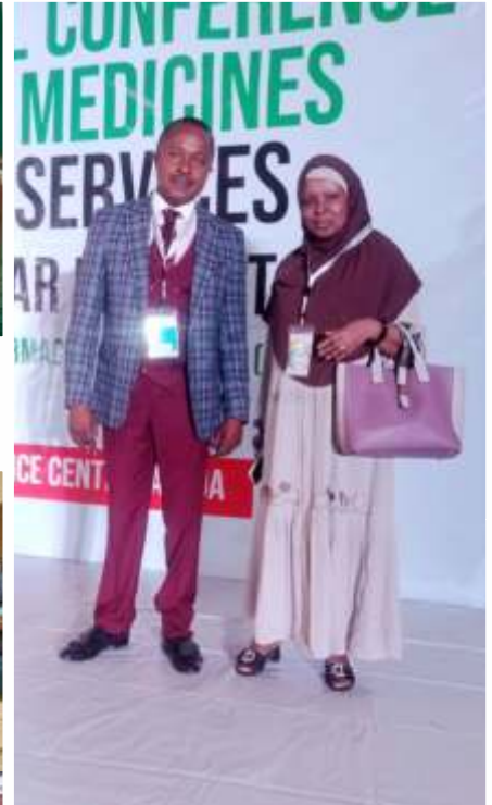
ACPN KAD DELEGATES AT THE MID YEAR INTL CONF ABJ. MAR24