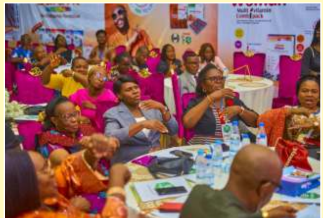
A Cross section of ACPN Rivers 2024 State Scientific Conference/Annual General Meeting.