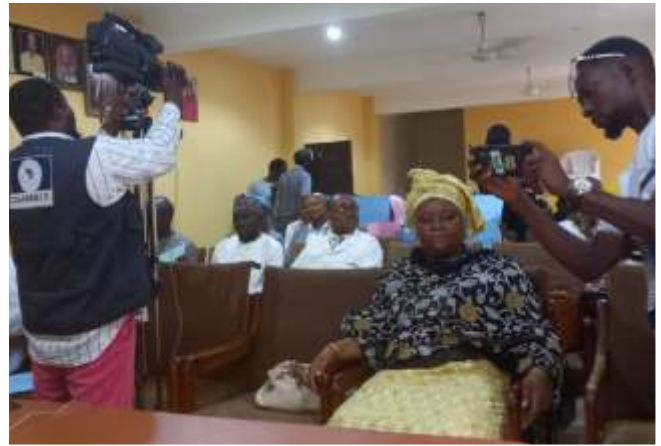
ACPN @ AT THE PRESS RELEASE ON NDLEA INCESSANT ATTACKS ON PHARMACISTS IN KD STATE