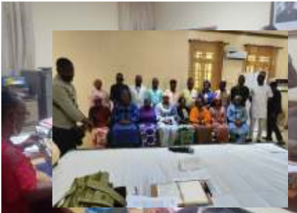
12.PACS INAUGURAL MEETING @ BAFRA HOTEL 03 24