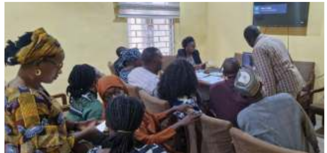
ACPN GEN MEETING FEB 24