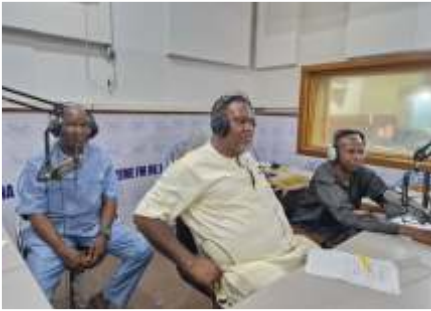
KD ACPN CHAIR LIVE ON FM RADIO PROGRAM TACKLING THE MENACE OF DRUG ABUSE.