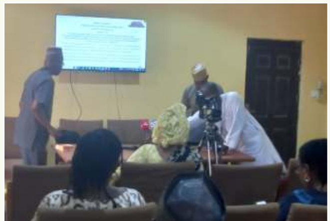
ACPN @ AT THE PRESS RELEASE ON NDLEA INCESSANT ATTACKS ON PHARMACISTS IN KD STATE