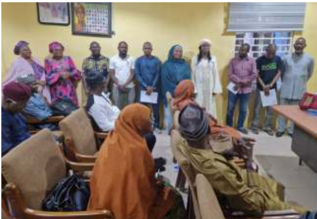
Current kd st PSN EXCO SWEARING IN