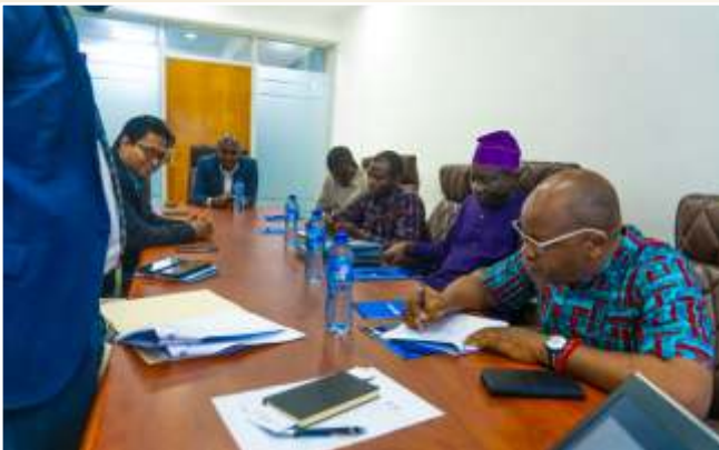
MOU SIGNING WITH SIMS NIGERIA