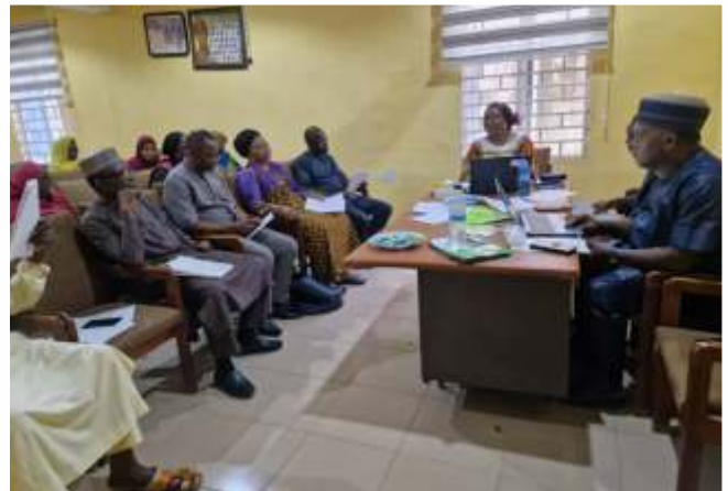
ACPN GEN MEETING 7 DEC 2023