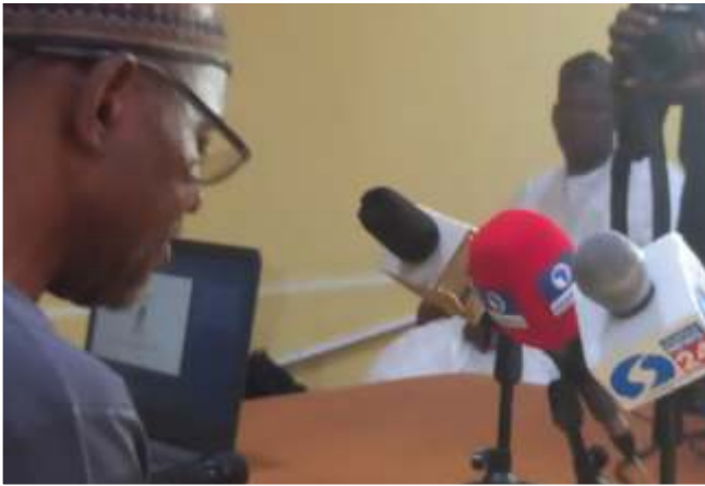
ACPN @ AT THE PRESS RELEASE ON NDLEA INCESSANT ATTACKS ON PHARMACISTS IN KD STATE